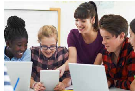
Choosing subjects and courses at 16