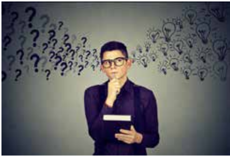
How to choose the right subject or course