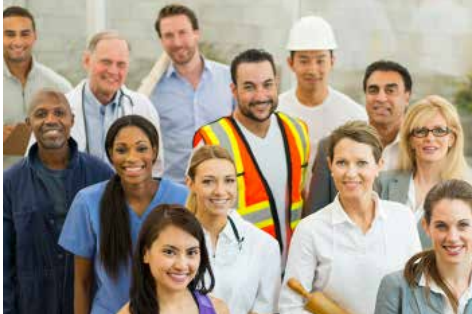
Getting a Job