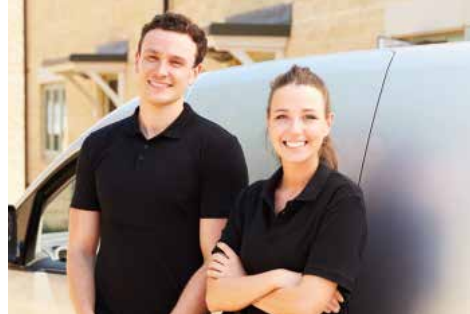
Getting into Self-employment