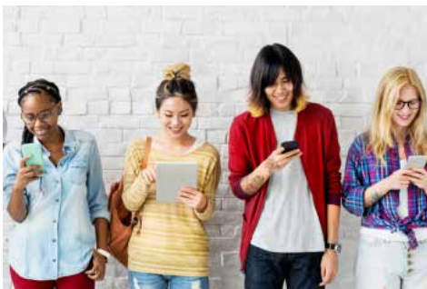
Options at 16