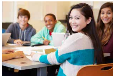
Options at 18