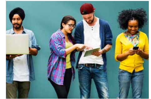
Choosing subjects and courses at 18