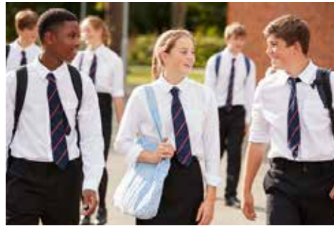
Choosing subjects in Year 8 and 9